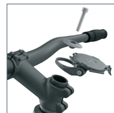
Mounting alternative 2