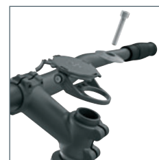
Mounting alternative 1