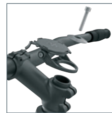
Mounting alternative 1